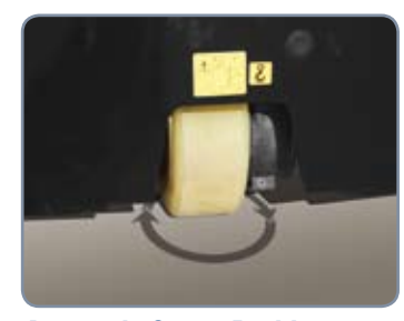
Automatic Center Position at Starting

When the key ON, prox switch detects the position of drive wheel, and the wheel turns to the center position automatically.