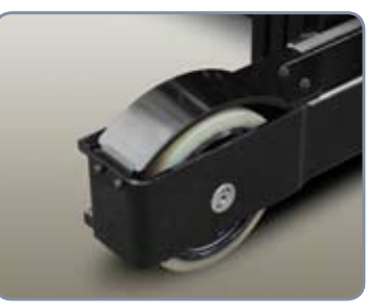
Electro-Magnetic Brake Increased brake torgue and brake stability by electromagnetic load wheel brake.