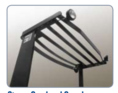
Strong Overhead Guard The safety overhead guard meets EEC and ANSI regulations and protects the operator during hazardous work.