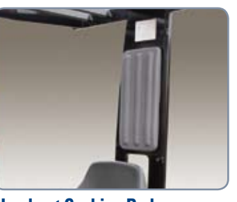
Headrest Cushion Pad A large and soft cushion pad is positioned for operator's safety and comfort.